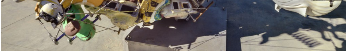
Nancy Rubins.

It's a new year, which is a fine excuse as any to ditch old bad habits. Here below, I have assembled a not-at-all exhaustive list of art-writing words that I could do without in 2015. I admit, I've been guilty myself of abusing some or all of them—but of course that's what New Year's resolutions are for.