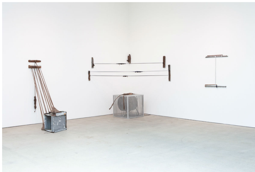
Senga Nengudi. A.C.Q. (I) (2016-2017). Refrigerator and air conditioner parts, fan, nylon pantyhose, sand.

Nengudi also manages to embed a political subtext into the show as well. In a corner above the fan in A.C.Q. , small bundles of sand are tied to lines of nylon. These resemble barbed wire, stretched between the gallery's walls to mark off a small refrigerator component nestled into the corner.