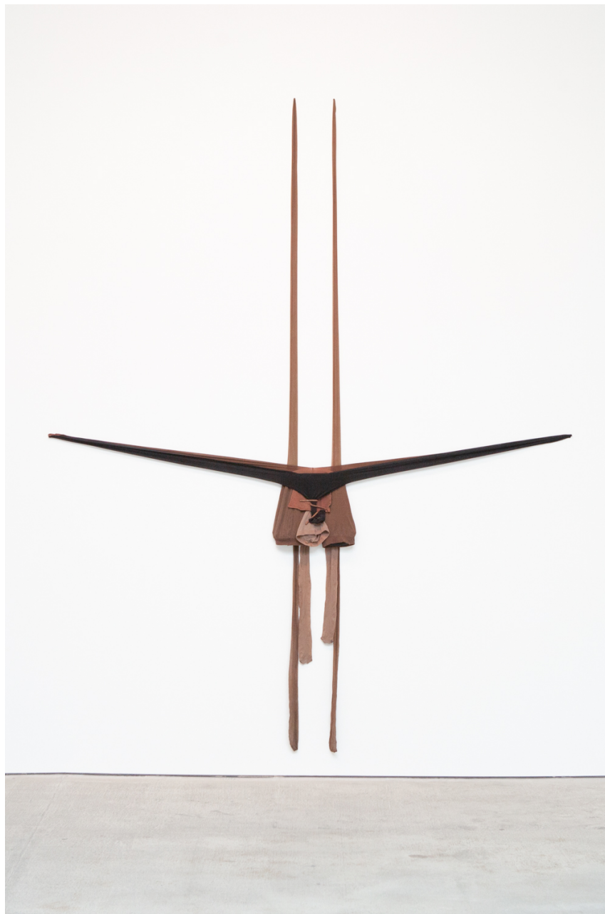
Senga Nengudi. A.C.Q. (III) (2016-2017). Refrigerator parts, nylon pantyhose. Courtesy of Lévy Gorvy Gallery, New York and Thomas Erben Gallery, New York.

The Art + Practice show collects work that Nengudi describes as “stationary performance pieces.” These include photographs, her signature “R.S.V.P.” series of pantyhose installations, and video installations that illustrate how performance and the creative synergy of collaboration not only brought her work to life but were critical to opening up new avenues for her own practice.