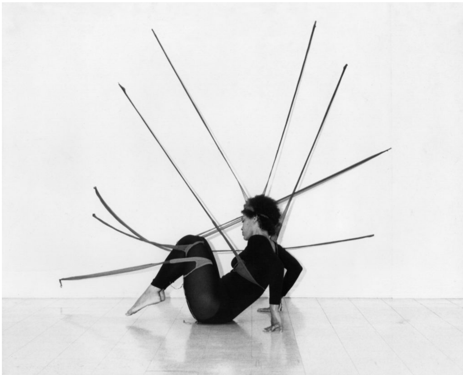
Senga Nengudi. Performance Piece (1978). Black and white photographs.

Colony Little ( https://news.artnet.com/about/colony-little-824 ), July 3, 2018