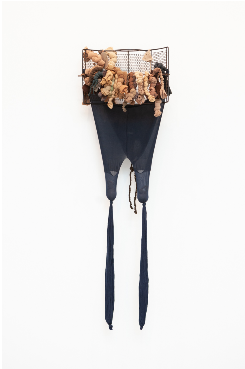
Senga Nengudi. R.S.V.P. Reverie – A (2011). Nylon mesh, sand, found wire object.

The stretched nylon works of Nengudi's "R.S.V.P." installations were originally inspired by the physiological changes in her body after experiencing childbirth. Current iterations, on the other hand, have shifted to examine the emotional changes we experience as we age.